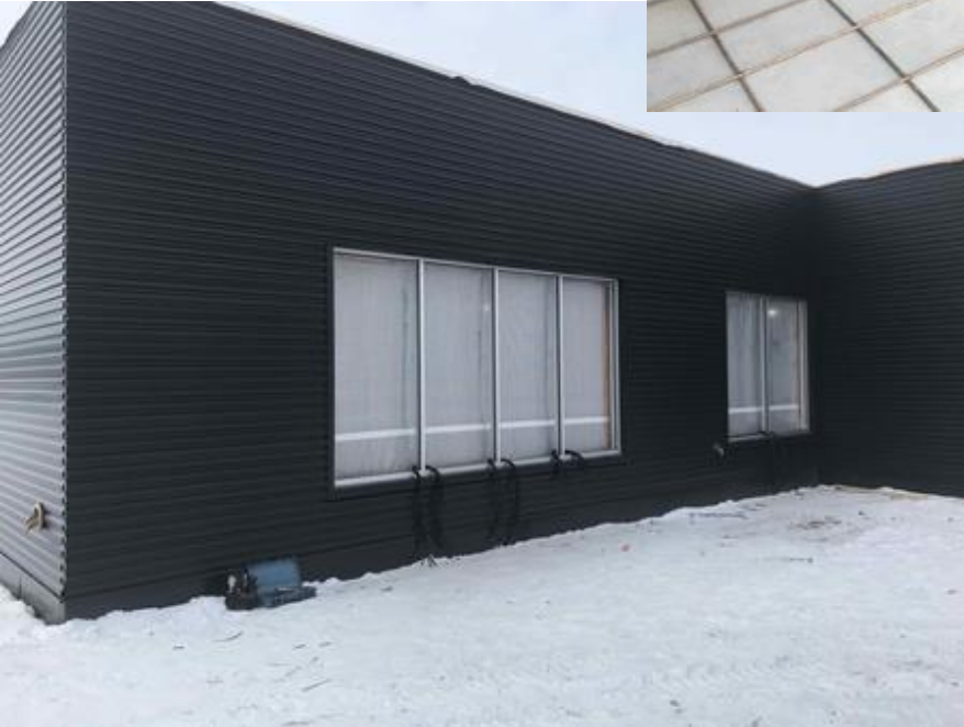
Window Frame Installation