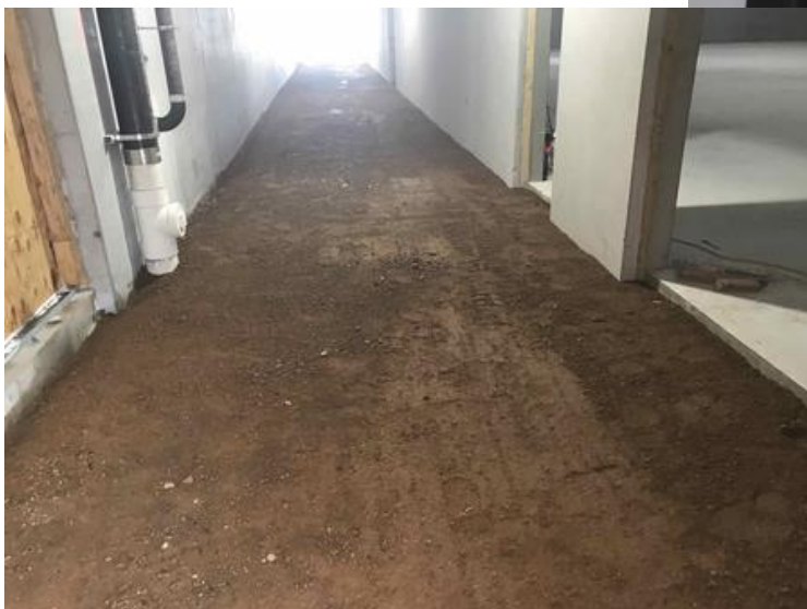
Metal Shop Office Ceiling Tile