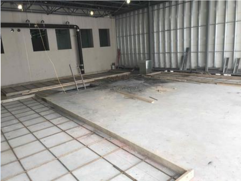
Mechanical Mezzanine Concrete