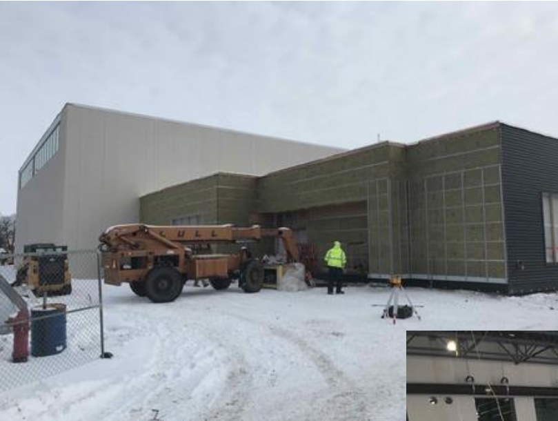
West Side Exterior Wall Insulation