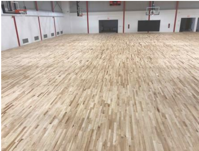
Gym Floor Sealing