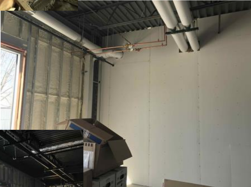
Sheetrock and Exterior Insulation Install