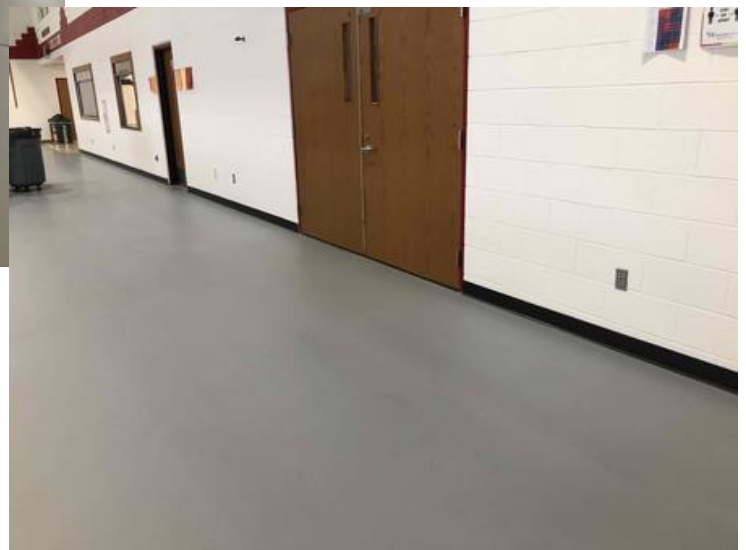
Commons Floor Base Install