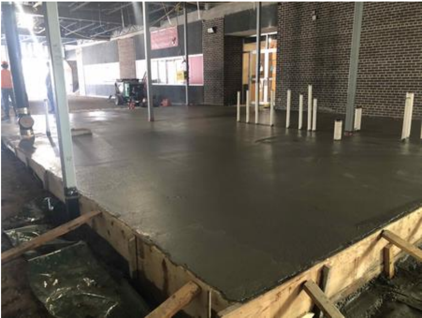
East Half Concrete