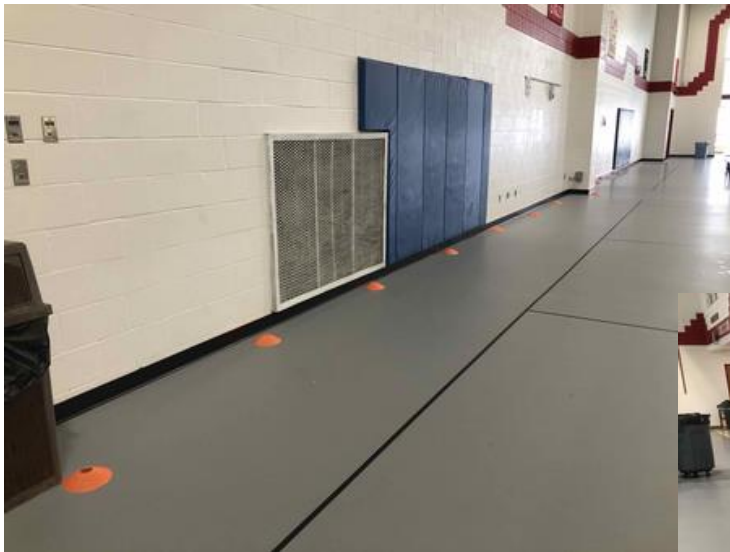
Commons Floor Base Install