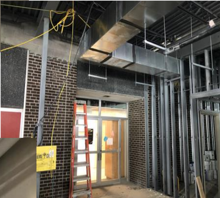
Soffit slated for removal