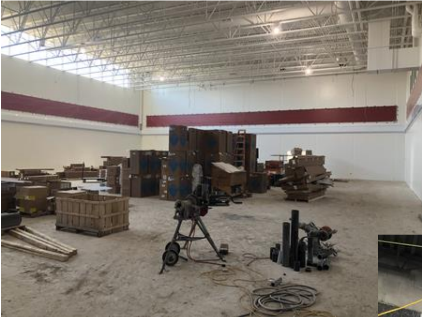
Gym Acoustical Panels