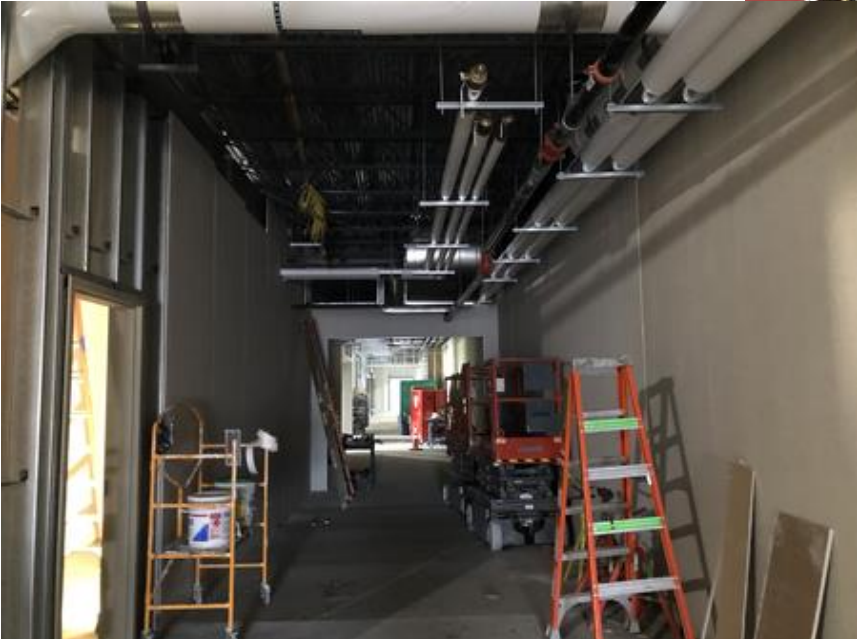
Main East – West Hallway