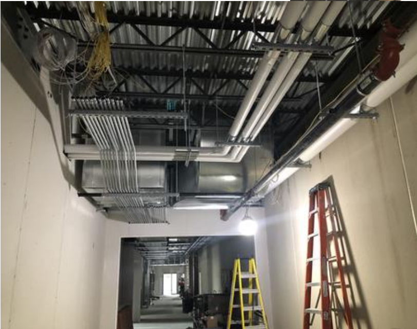
Main East – West Hallway