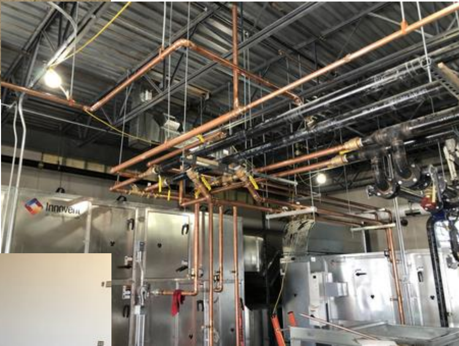
Mech Room Piping