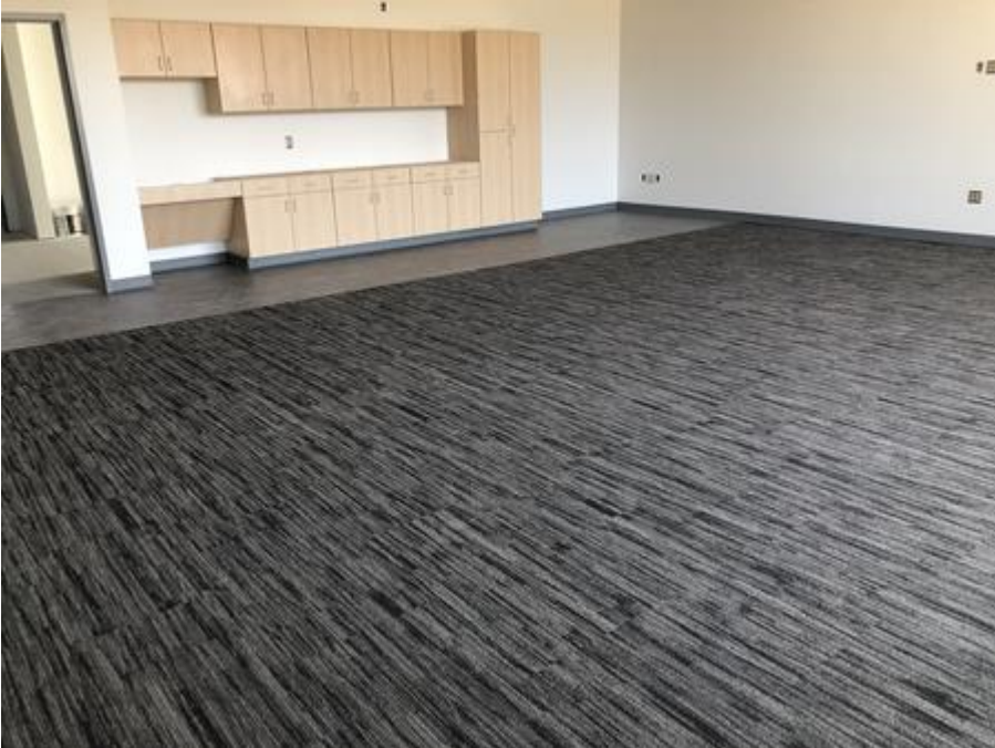
Carpet & LVT