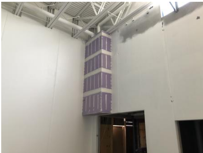
Drywall Chase Installation