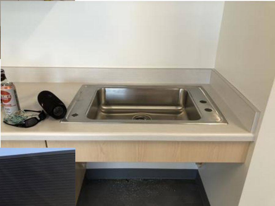
Countertop with Sink